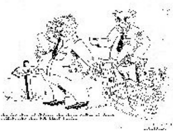
Click for full size picture. (12K)